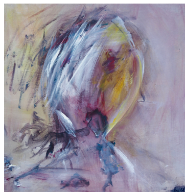
The hidden Man 3 Acrylic on canvas 40 x 40 cm