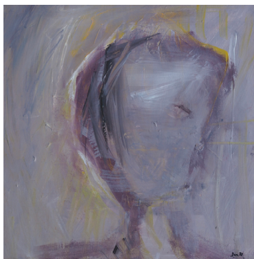
The hidden Man 2 Acrylic on canvas 40 x 40 cm