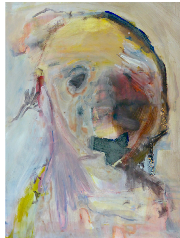
Untold Acrylic on canvas 80 x 60 cm