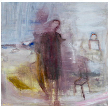
Forgiveness/The Frieze of Life Acrylic on canvas 75 x 75 cm