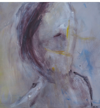
The hidden Man 1 Acrylic on canvas 40 x 40 cm