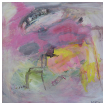
Awareness Acrylic on canvas 60 x 60 cm

How do you describe yourself as artist to someone who doesn't know you?