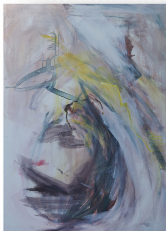
Bring Forth, 100 x 70 cm, acrylic on canvas, 2017