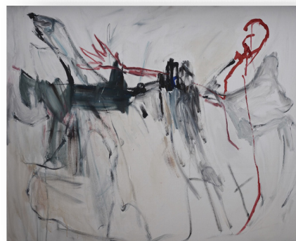
The Untold Truth, 100 x 120 cm, acrylic on canvas, 2017