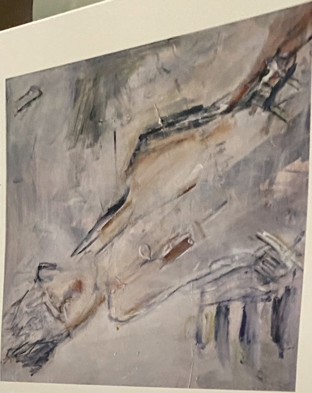
Metamorphosis VII acrylic 75x75 cm